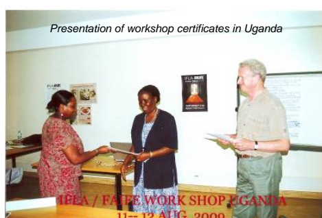
Presentation of workshop certificates in Uganda