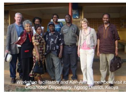
Workshop facilitators and Ken-AHILA members visit to Oloshobor Dispensary, Ngong District, Kenya