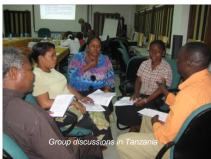
Group discussions in Tanzania

Currently the main project of the Alliance is to strengthen training and education of health workers in Zambia. The Alliance provides a focal point to help ensure that Zambia's health needs and requests for support and mutual development are known and understood by UK organisations and to ensure better coordination between all the many groups which have links and partnerships between the two countries – e.g. universities, hospitals and other health organisations, diaspora groups, NGOs, private companies and government departments. For further information about the activities and outcomes of this project, and the Alliance in general, please visit the Alliance's website