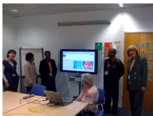
Kenya partnership members and guest viewing new Phi website

Phi has a new website which is transforming the way and the speed with which we are able to communicate our work and post news and resources, amongst many things. We would like to thank the London Deanery for developing and hosting the site and for all the ongoing support they are providing. ( Phi website ). Phi has also recently set up a profile on Facebook ( Facebook page ). Please take a look at both.