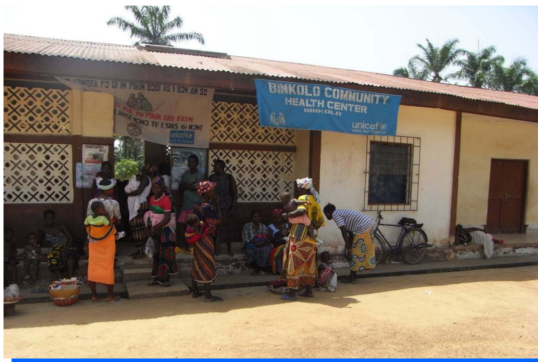
Binkolo Community Health Center, Sierra Leone