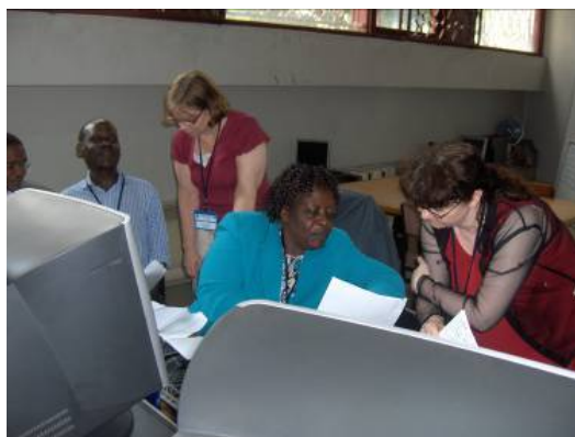
Participants and facilitators at the Evidence Based Medicine workshop